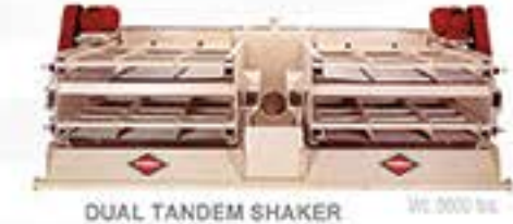
DUAL TANDEM SHAKER