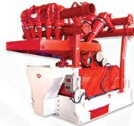
MUD CONDITIONER UNIT