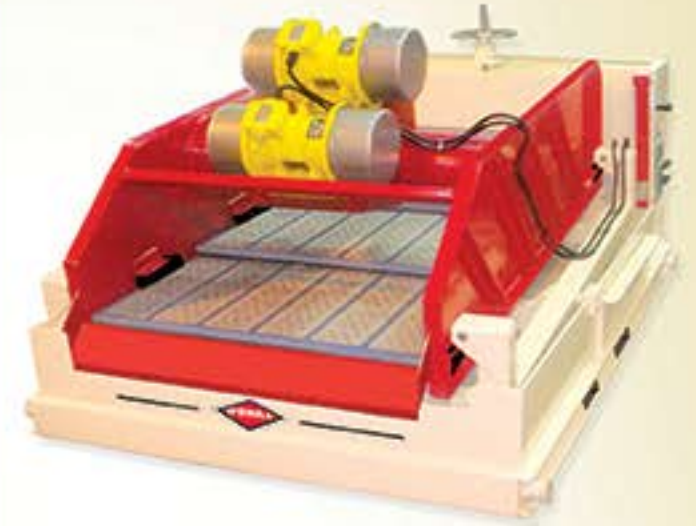
Heavy Duty Linear Motion Shaker