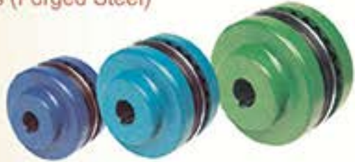
Alignment Pump Couplings