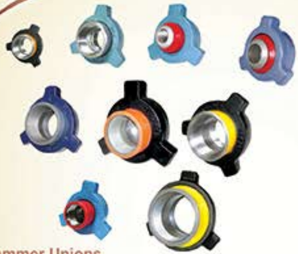
Hammer Unions All sizes (Forged Steel)