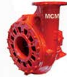
12x14x22 XL Pump