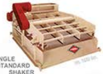
SINGLE STANDARD SHAKER