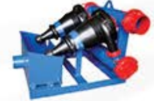
12" Horizontal Desander