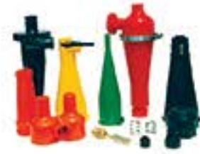
HYDROCYCLONES For all O.E.M.