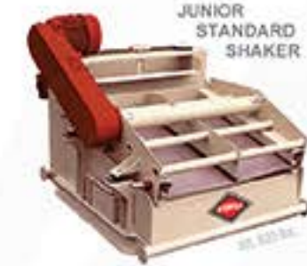
JUNIOR STANDARD SHAKER