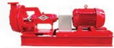
Mission® & Halco® Type Pumps & Skid Mounts