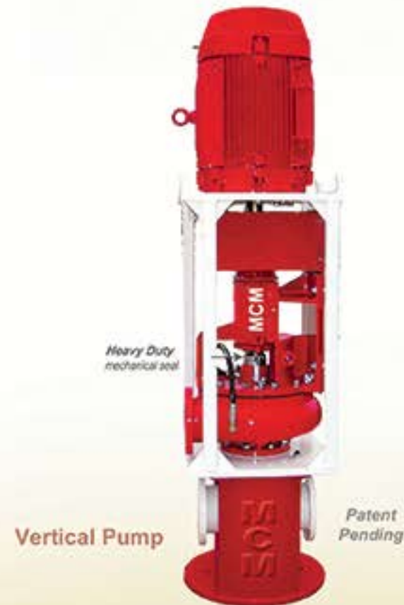
Heavy Duty mechanical seal