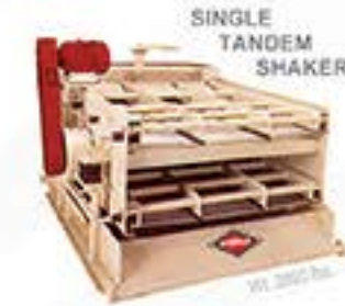
SINGLE TANDEM SHAKER