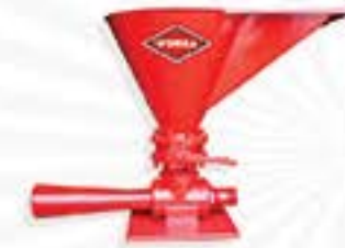
4" & 6" MUD HOPPERS