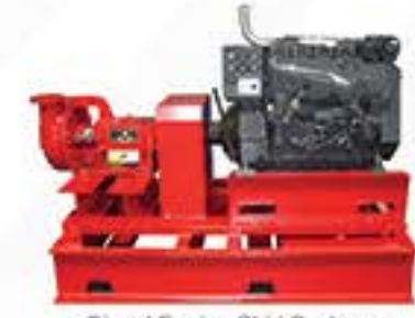
Diesel Engine Skid Package