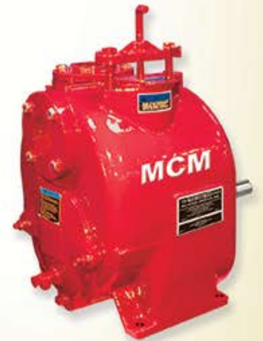
3", 4", 6", 8", & 10" Self Priming Trash Pumps