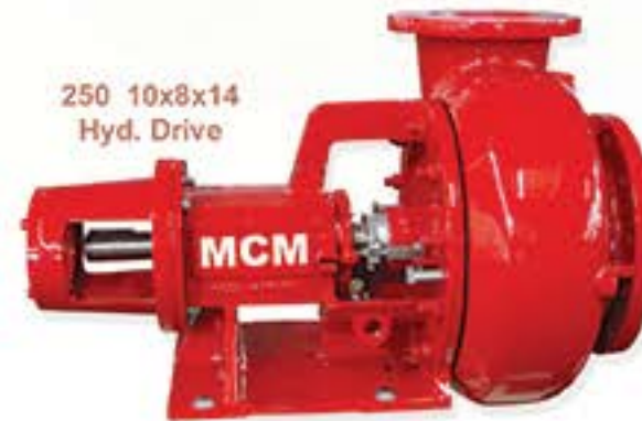
250 10x8x14 Hyd. Drive