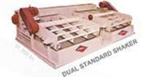
DUAL STANDARD SHAKER