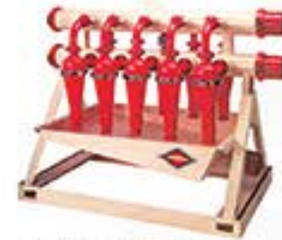
4" & 5" DESILTERS