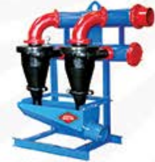
12" Vertical Desander