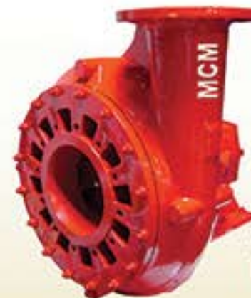
XL 12x14x22 Frac Pump