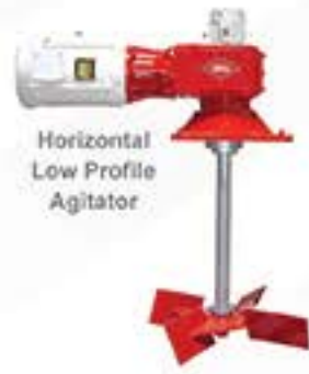
Horizontal Low Profile Agitator