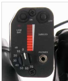
LED display and sensitivity dial