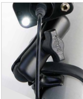
Mounting kit included