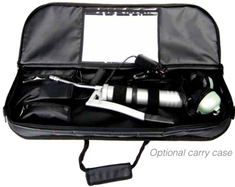
Optional carry case