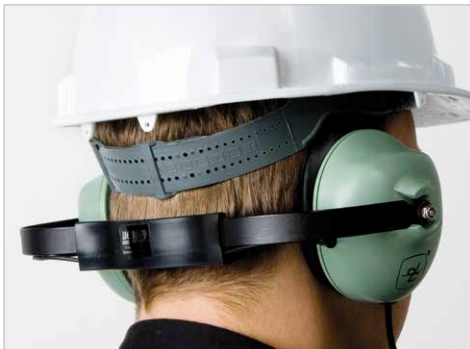
Headset for hardhat use