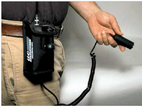
Holster for UP 201