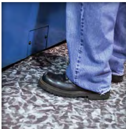
● INCREASE SAFETY ●