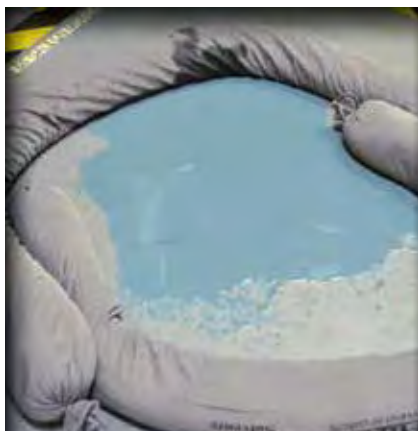
● CONTAIN LIQUIDS ●