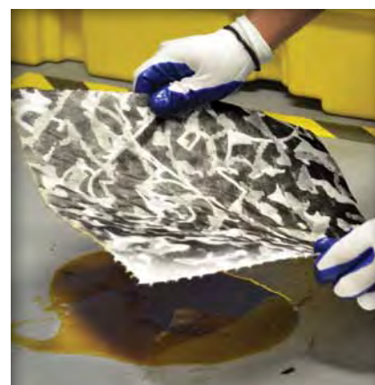
● CLEAN UP SPILLS ●